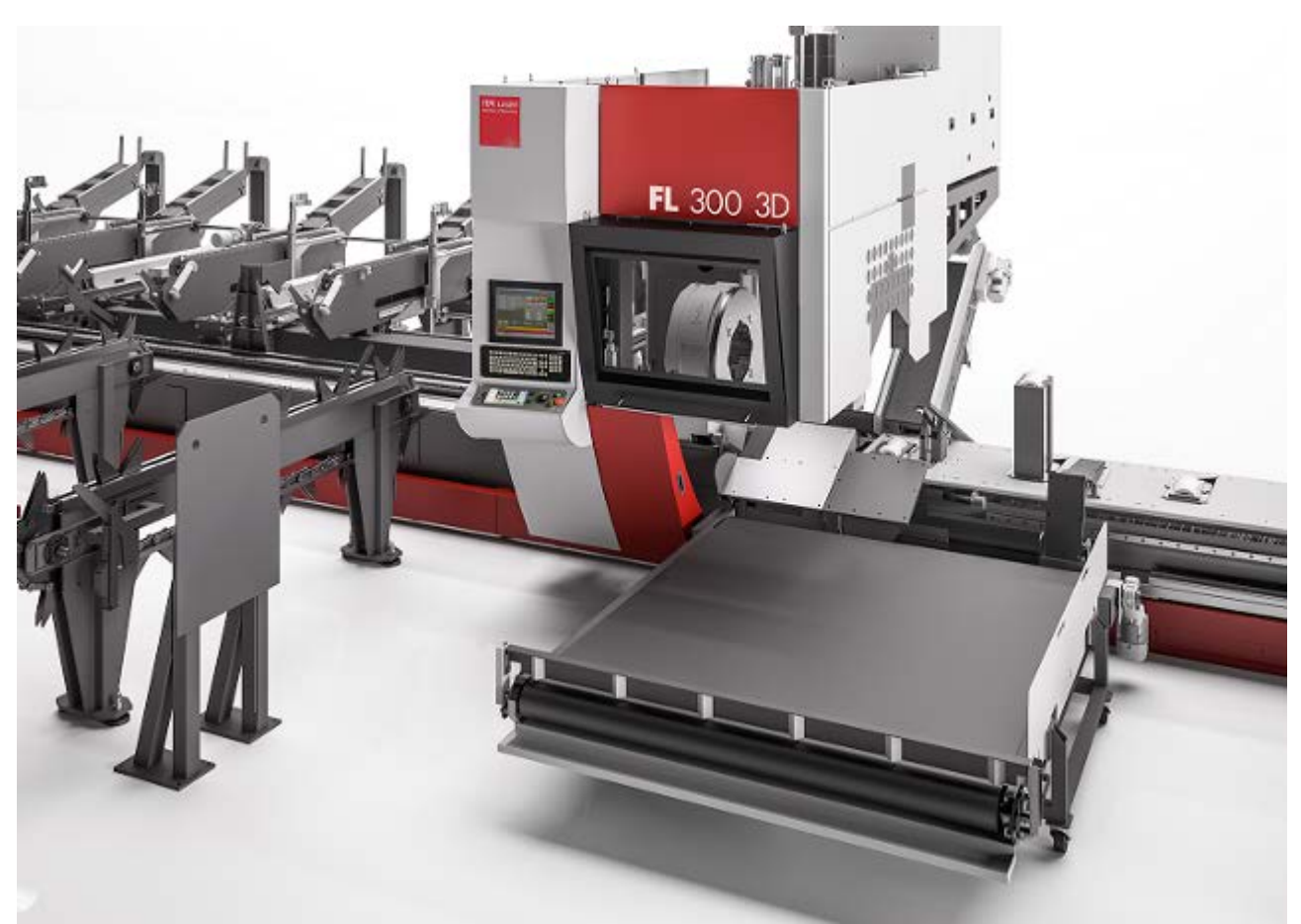
This layout may not correspond to the offered machinery.

The machine is driven by the NC TTMotion, a modern digital NC at 32 bit on industrial hardware and specifically engineered for the 3D laser cutting machines. The man-machine interface has been engineered by Bystronic Tube Processing and it is user-friendly.